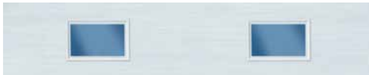
21" x 13" SHORT PANEL*