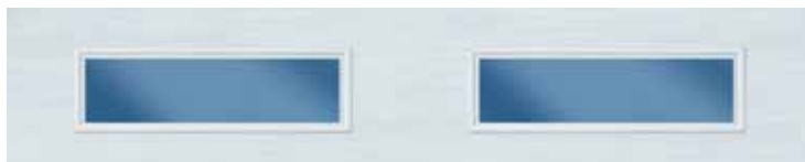
41" x 13" LONG PANEL*