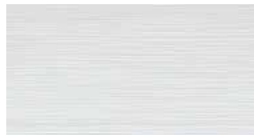
FLUSH PANEL WITH WOODGRAIN EMBOSSMENT